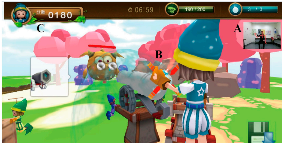
FIGURE 1 | The game screen and the feedback during the gameplay. (A) A participant playing our Kinect game with a Kinect skeleton tracker. (B) The visual feedback on the upper limb movements of the player (Knowledge of performance). (C) The performance score during gameplay as another form of feedback (Knowledge of results).