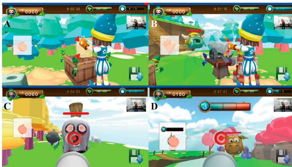
FIGURE 2 | A Kinect-based CIT program was designed with three levels of task difficulty. In the preparation stage (A) and the first level (B) , the movement training goals include reaching, grasping, and releasing. In the second level (C) , the training goals include reaching, grasping, releasing, and aiming. In the third level (D) , the goals consist of reaching, grasping, releasing, aiming, and holding.

the trials) was chosen for the game. Third, a shaping skill was used for game design. It emphasizes progressively increasing the task difficulties in temporal and spatial dimensions, as well as accuracy of movement (Abd El-Kafy et al., 2014). During the cannonball gathering stage, cannonballs randomly appear in four directions relative to the player: inward, outward, upward and downward. There are three levels of game difficulty. At the game with higher difficulties, the movements are more complex and more